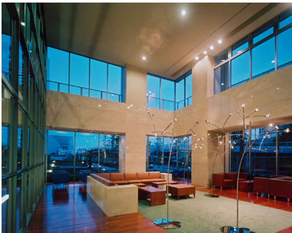
[BAY CREST TOWER]