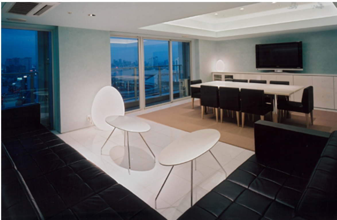
[BAY CREST TOWER]