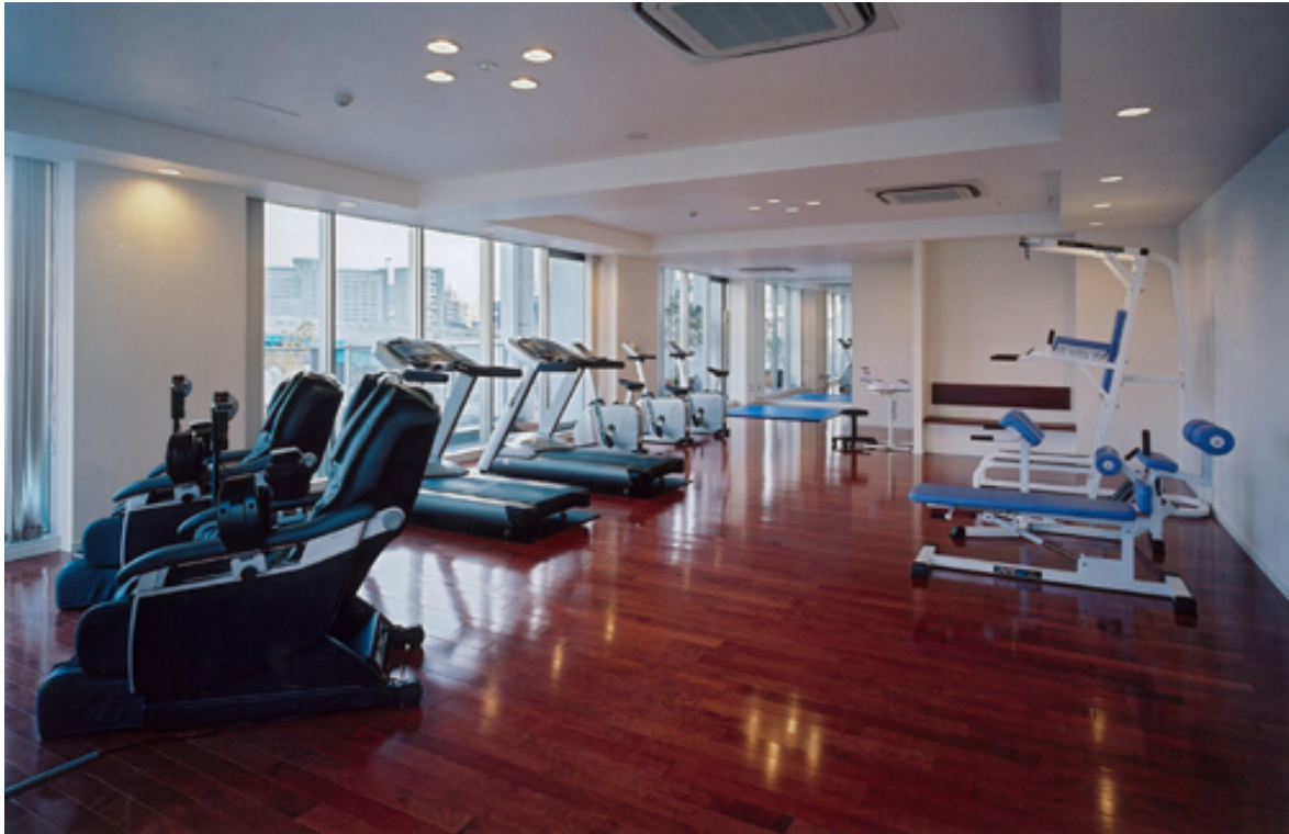
[BAY CREST TOWER]