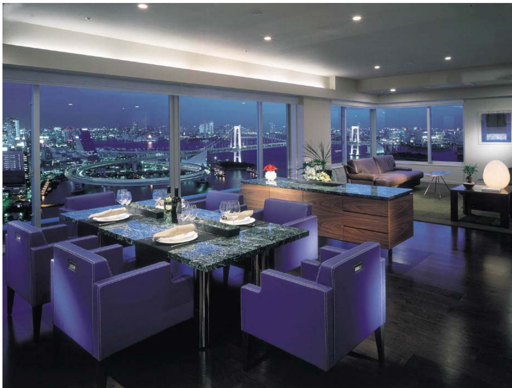
[BAY CREST TOWER]