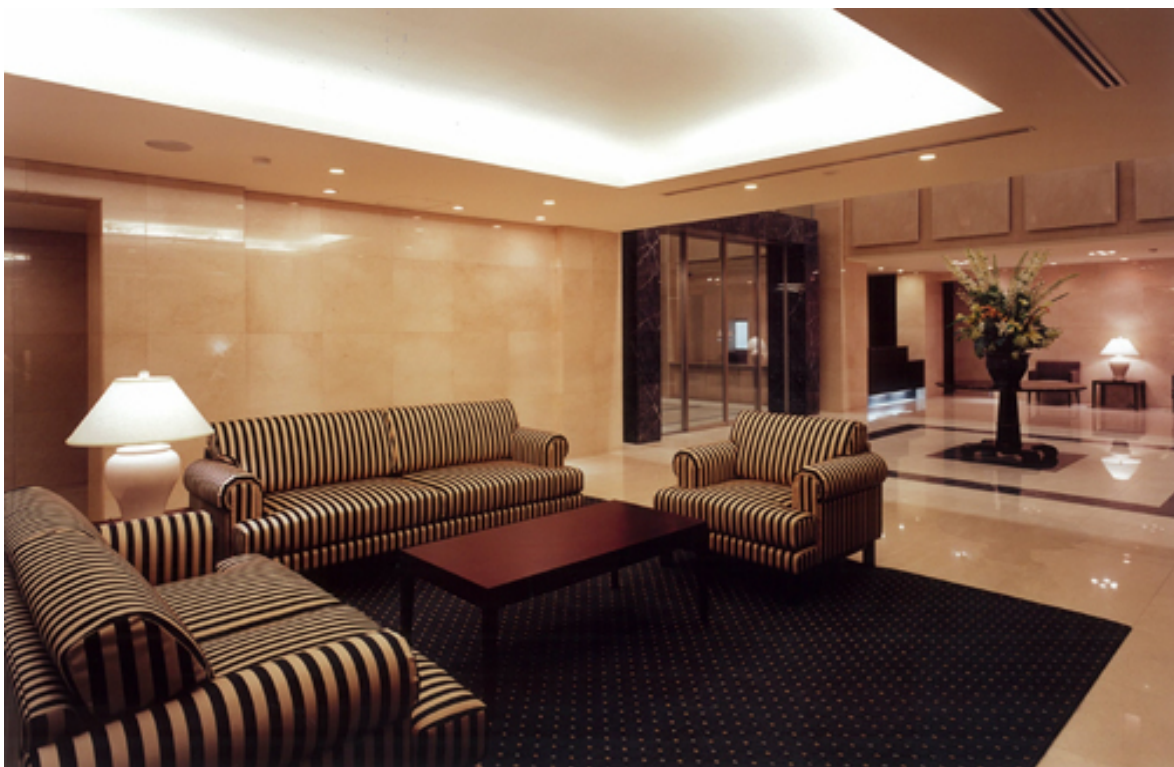
[CREST GRANDIO YOKOHAMA]