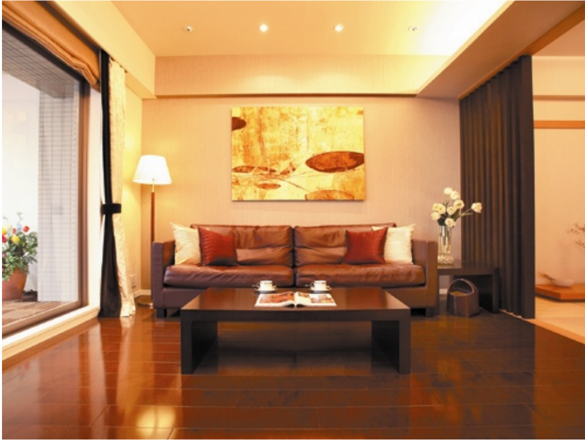
[CREST FORME MUSASHINO GARDEN COURT]