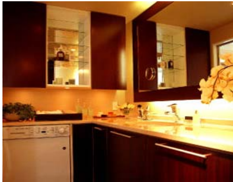
[CREST FORME MUSASHINO GARDEN COURT]