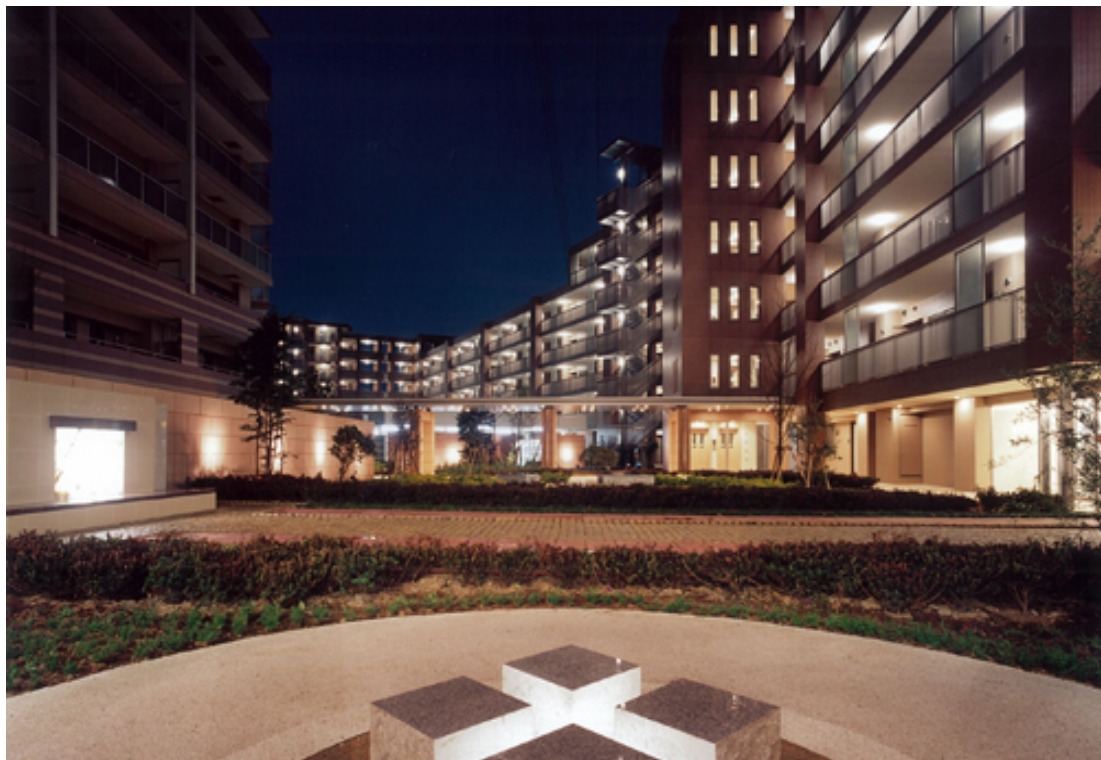
[CREST GRANDIO YOKOHAMA]