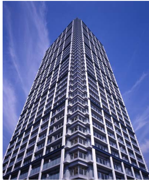
[BAY CREST TOWER]

GOLDCREST was established in 1992 with the aim of providing high quality condominiums at affordable prices. We define High Quality condominiums as those with ample space, high ceilings, high quality facilities, and concierge services much like those found in an exclusive hotel. We define Affordable Prices as those our customers find attractive and lower than our competitors.