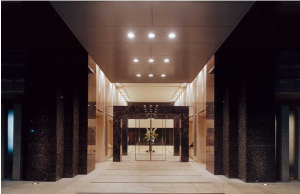
[CREST GRANDIO YOKOHAMA]