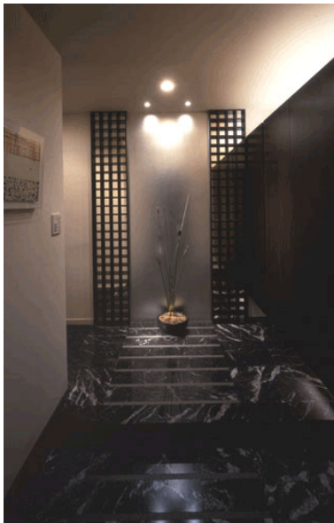
[BAY CREST TOWER]